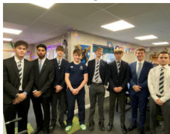
Top of the Positives group (Weekly)