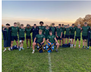
Well done to the House Rugby teams and Shooting team